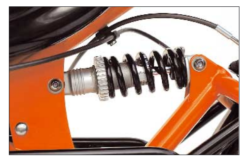
Suspension element DV-22 with fixed damping rate.

Your Street Machine GT comes standard with a suspension element of which the springs can be exchanged and the pre-load adjusted. The damping in this suspension element is set to a fixed rate.